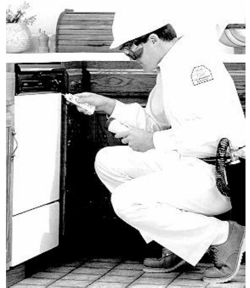
Injecting Avert gel into cracks

Knowing where to place baits is critical. Avert may need up to 24 bait points per 100 sq ft and require 5 to 7 days to be effective. Placing material in cracks is a way to reduce exposure to people and pets.