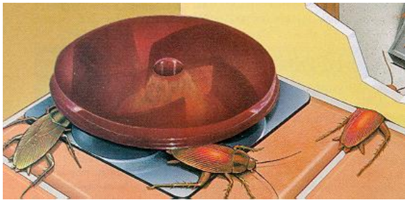
Roach Bait Station

Knowing where to place baits is critical. Avert may need up to 24 bait points per 100 sq ft and require 5 to 7 days to be effective. Placing material in cracks is a way to reduce exposure to people and pets.