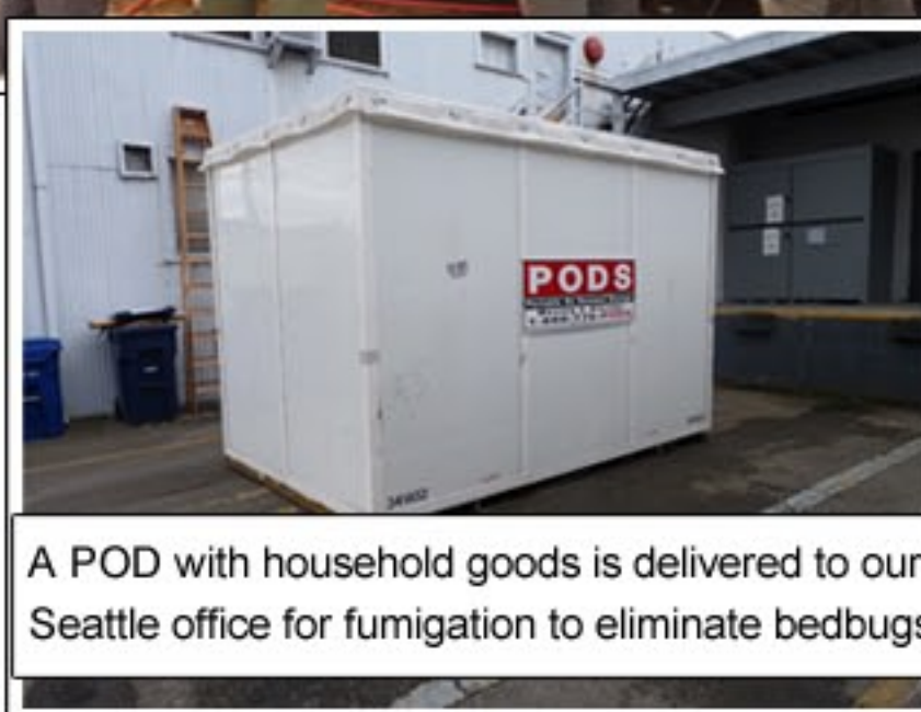
A POD with household goods is delivered to our Seattle office for fumigation to eliminate bedbugs.