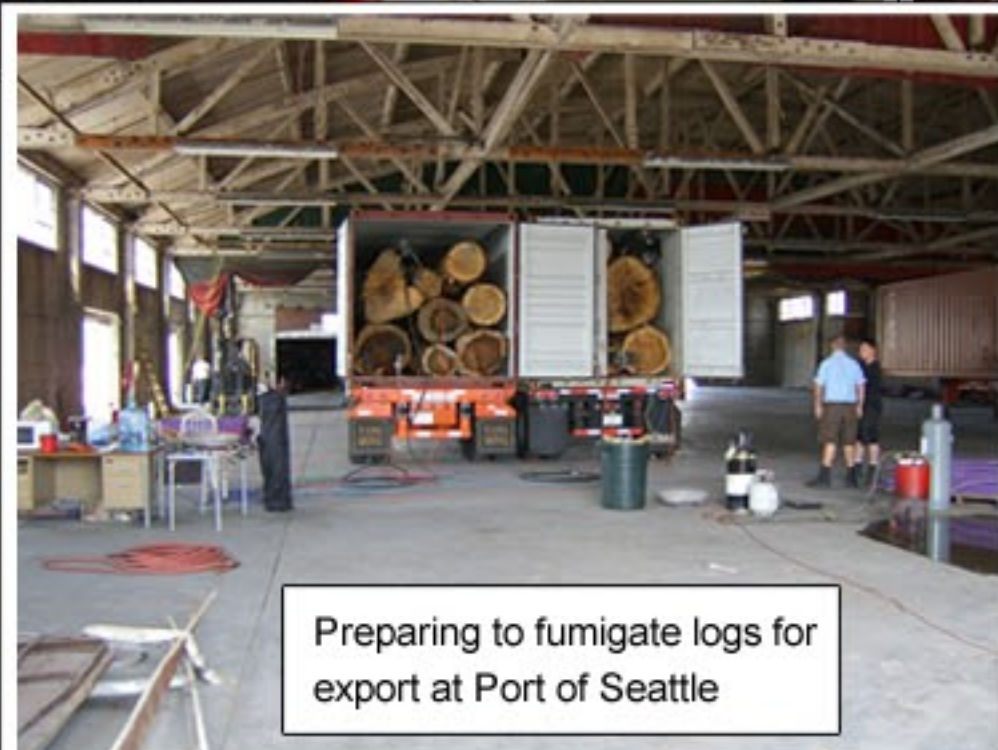
Preparing to fumigate logs for export at Port of Seattle